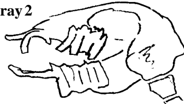
Deformed teeth and roots